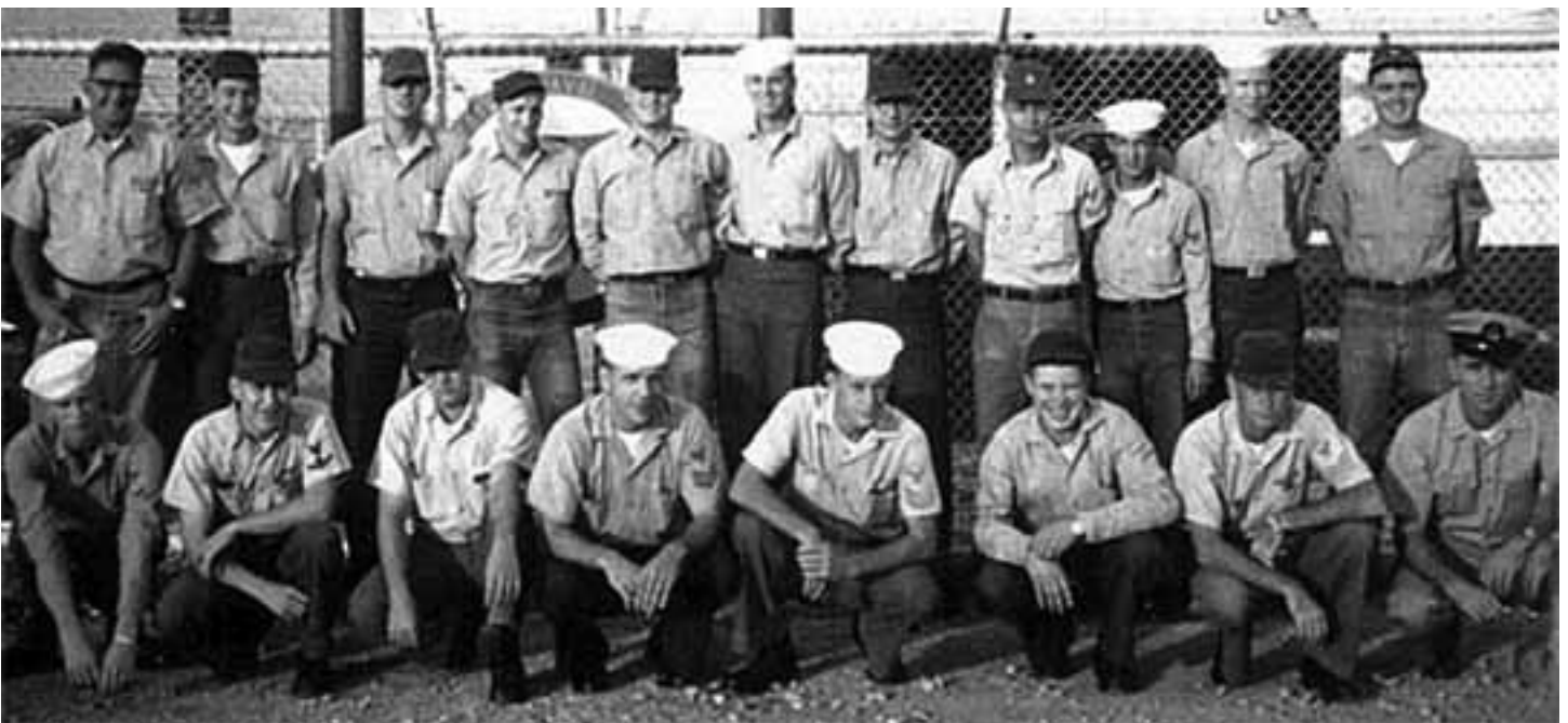
Okinawa Mine Shop Crew circa 1966 (old flight line quonsets)