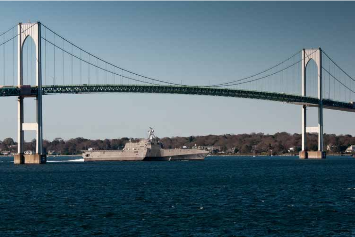
USS INDEPENDENCE (LCS-2) arriving in Newport, Rhode Island