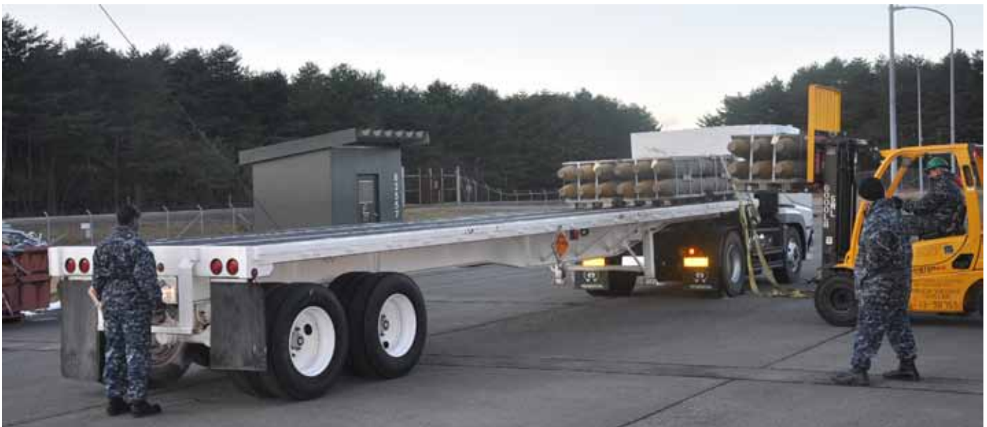
MNC(SW) Montalvo, AO1(AW/SW) Henderson and MN3 Prewitt from QA department watches closely as a pallet of BLU-111A/B bombs are picked up and loaded on to a semi-truck -